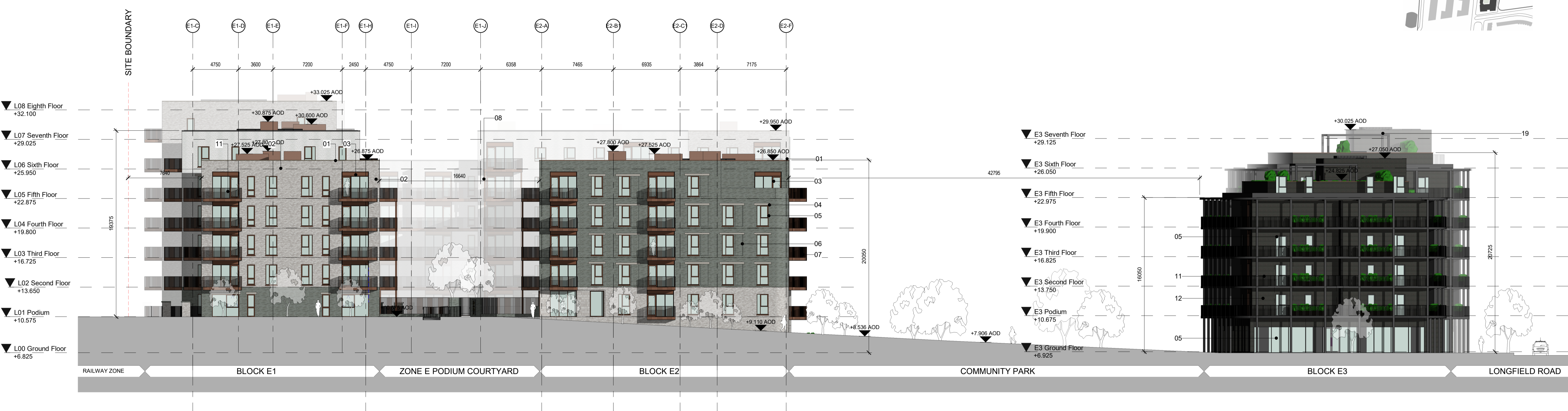
1 ZONE E SOUTH ELEVATION 1:200